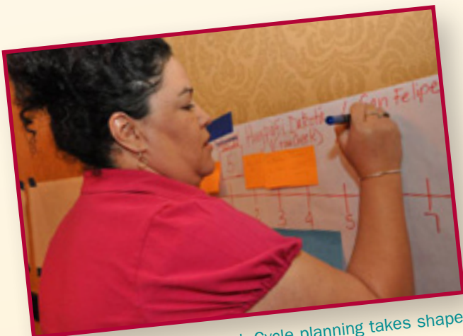
Book Cycle planning takes shape