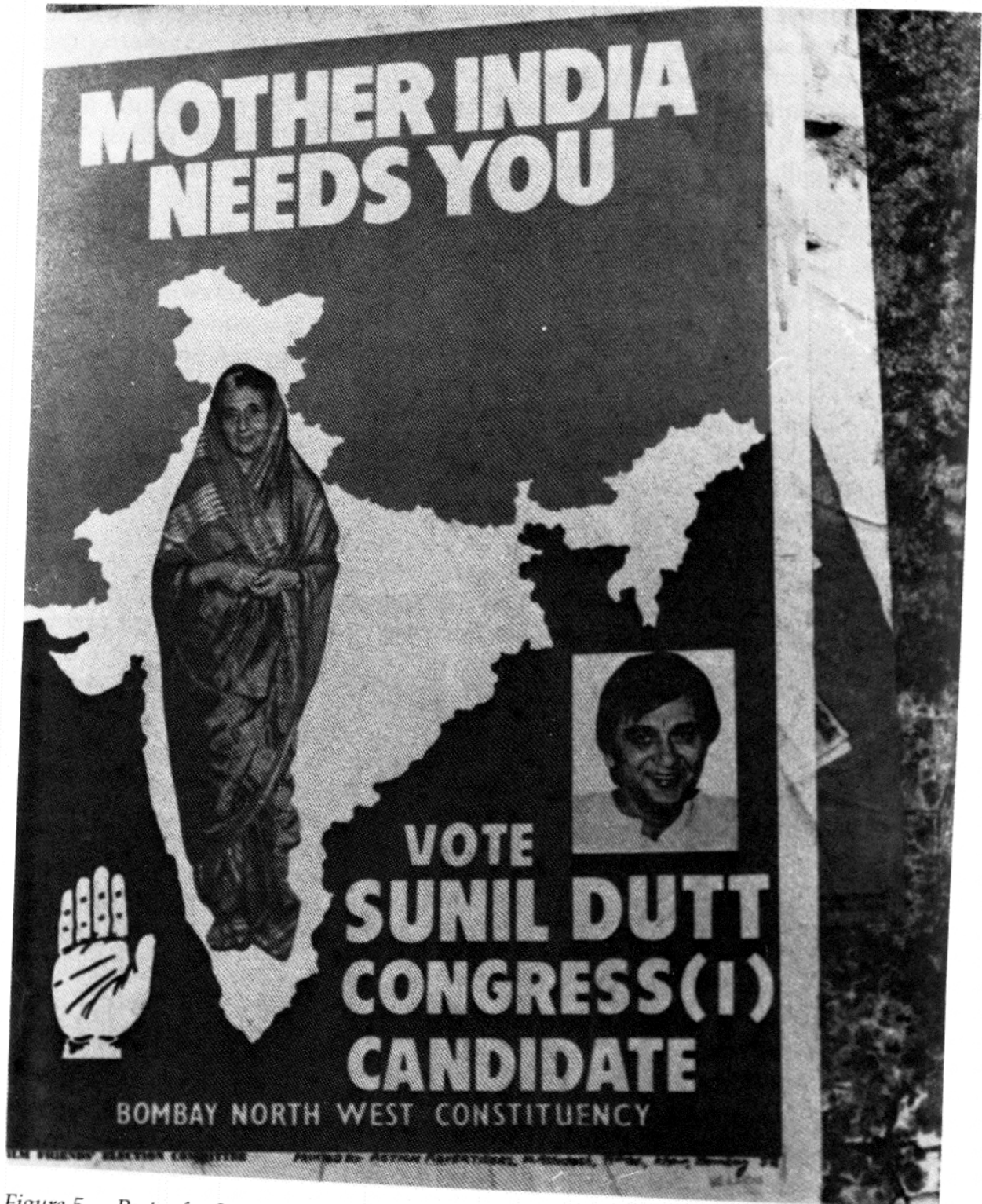
Figure 5. Poster for Sunil Dutt's campaign for Parliament, 1985.