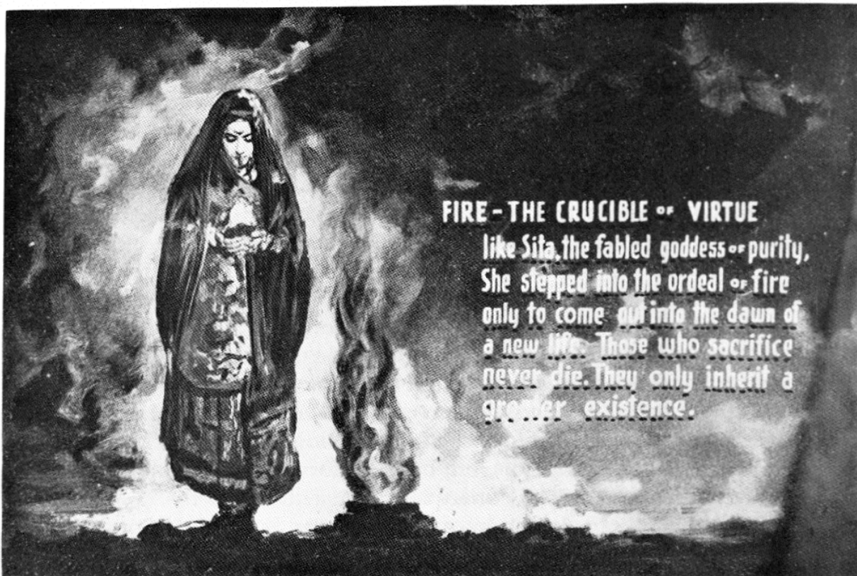
Figure 4. Image from the publicity booklet for Mother India .

Somewhat strangely, this description fits the gossip story better than the overt sense of the film scene, which not only makes no explicit reference to Sita but is more obviously about testing Radha's devotion to, and unflinching protection of, her son —and his to, and of, her. The fact that the film's testing of the mother's devotion and son's power is played out in an idiom that echoes Rama's testing of the chastity of his wife, Sita, leads to an interesting elision: Birjoo the son plays out the role of Rama the husband, the fantasy of the son displacing the husband/father. These are, in fact, peculiarly intense scenes: around these moments, Radha and Birjoo appear most like lovers, the mise-en-scène becomes revealingly extravagant and patently excessive. The sequence culminates in a crescendo of orchestral strings