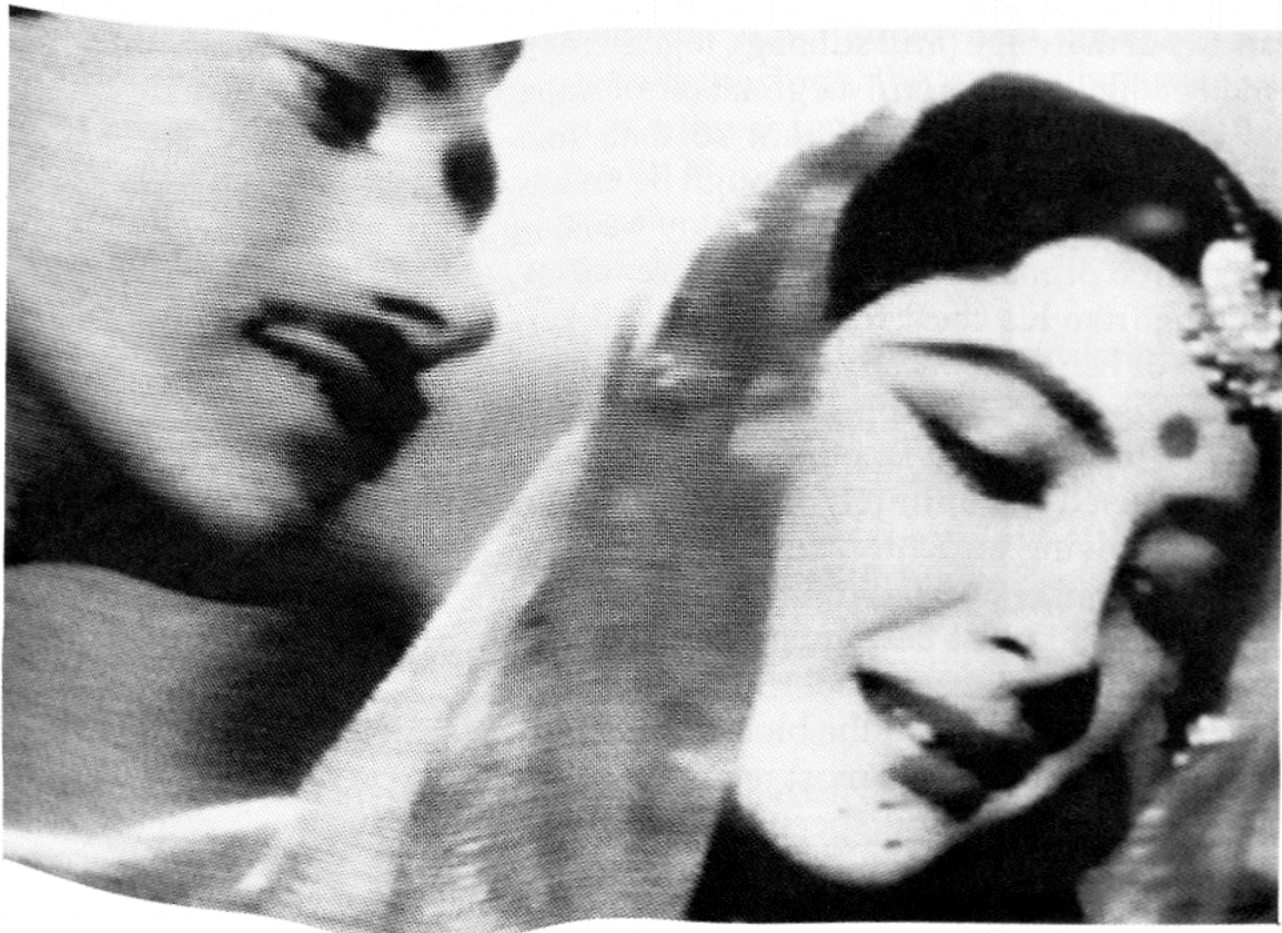
Figure 2. Nargis and Raaj Kumar as her husband in Mother India .

The types of images that erupt in the course of the film vary from shots of Radha heroically enjoining the villagers not to desert their motherland to images of her being trampled underfoot by them; from being carried out of blazing haystacks in her son's arms to stuffing chapatis into her sons' mouths as they pull a plough through their fields; from shots that look down on her blushing coyly behind a wedding veil or as sindoor (vermilion) is placed in her hair to shots that look up at her proudly striding forward harnessed to her plough; from shots of her crying on her son's shoulder and pleading with him as a lover might to the images of her wielding a heavy stick, ax, and, finally, gun. The most powerfully horrifying image is of Radha leveling a shotgun at her son. But, in fact, all the central male figures are destroyed or implicitly "castrated" by association with her: she kills her favorite son; her husband loses both arms (and implicitly his manliness) following her insistence that they plough some barren land; the villainous Sukhilal ends up covered in cotton fluff, cowering like a naughty infant as she beats him with a big stick, and pleading abjectly with her to save his daughter's izzat; and her elder son Ramu becomes ineffectual in her shadow. Thus, she is both venerator of men and venerated by them as devi (goddess) and maa (mother), and she is, in turn, in need of men's protection and a protector and destroyer of men.