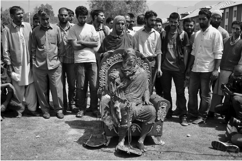
FIGURE 5. APDP Protest, International Day of Victims of Enforced Disappearance, August 30, 2014.

These forms of action are not only directed toward the past. They reinterpret the past, but at the same time they stake claims in the present with reference to the future. They actively intervene in producing and circulating alternative representations of Kashmir that challenge and destabilize hegemonic representations that dominate mainstream Indian narratives. Given the impossibility of relying on Indian media to represent their agony, Kashmiris have taken it upon themselves to foreground their experiences and engagements with the Indian state. Today, Kashmiri youths have turned toward writing and other forms of journalistic and literary expression as career pathways, in contrast to previous generations who maintained a focus on medical, engineering, and other technical fields. Much of this writing, while circulated locally, is also meant to draw in a broader global audience so that Kashmiris can actively forge ties of empathy and solidarity with oppressed peoples elsewhere and humanize their experience of a long occupation. Going beyond the framework of the nation-state through literary and artistic productions is a strategy for creating an alternative political space in which Kashmiri lives matter and their stakes in the state's political future are recognized and validated.