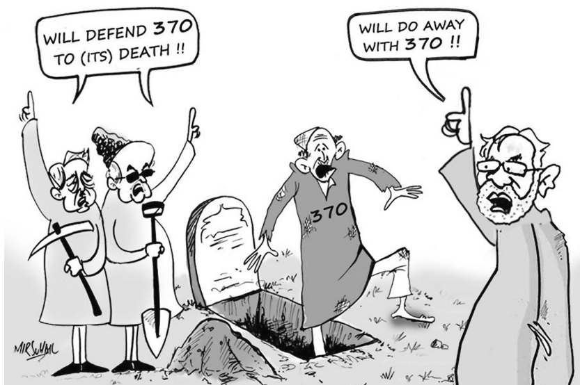
FIGURE 2. Political cartoon on Article 370. Credit: Mir Suhail 2014.

This facade of democracy in Kashmir emerges in the two political cartoons by Kashmiri artists featured here. Rather than simply critiquing central government attempts to abrogate Article 370, these cartoons foreground the complicity of Kashmiri mainstream politicians in maintaining the structures of occupation in Kashmir. In Mir Suhail's 2014 cartoon (Figure 2), Prime Minister Modi forthrightly calls for the abrogation of Article 370 while Kashmiri mainstream politicians—Farooq Abdullah and Mufti Sayeed, from Kashmir's political parties, the National Conference (NC) and the People's Democratic Party, respectively—engage in doublespeak about their commitment to safeguarding Kashmir's legal autonomy. Bashir Ahmad Bashir (Figure 3) represents Article 370 as a desiccated human skull hidden inside a box, produced as a prop for Kashmiri mainstream politicians to mobilize for garnering popular votes during elections. Similarly, Suhail presents Article 370 embodied in the figure of a vulnerable and distressed Kashmiri man, barefoot in tattered clothing, who stands with one foot in the grave dug by mainstream politicians while political elites determine his destiny, ostensibly