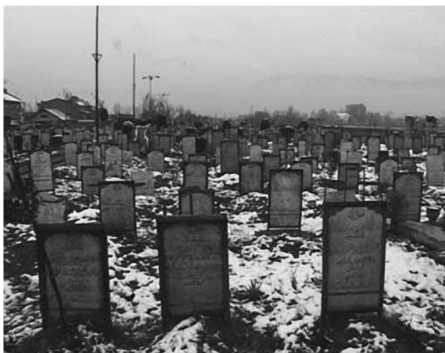
FIGURE 4. The Martyrs' Graveyard at Eidgah in Srinagar.

grassy park where political leaders have historically held profreedom rallies and where prayers are offered at the time of Eid-al-Fitr and Eid-al-Adha. In the film, an elderly man walks among the headstones searching for the grave site of his son, who was killed in the 1990s. “After such a long time,” the man says, “one forgets.” Kak’s cinematography lingers on the gray sky, the snowy ground, and the barren trees, evoking the atmosphere of longing, mourning, and suffering associated with the burial site. As this powerful image suggests, martyrs’ graveyards are very powerful symbolic sites of Kashmiri struggle and loss. They have transformed “dead bodies from the war into symbolic bodies” and become important representations of the movement—one of the most defining symbols of Kashmiri collective resistance, agency, death, and even sociality (Junaid, this volume).